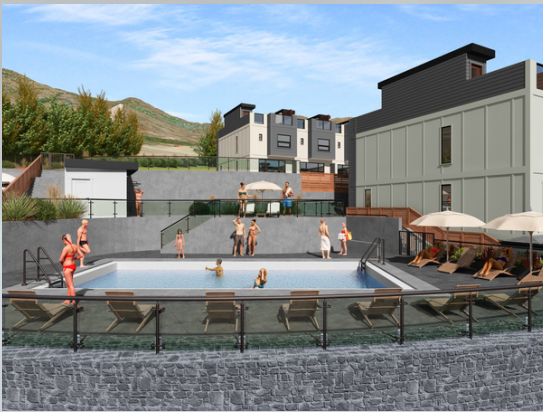
Summer Fun Activities