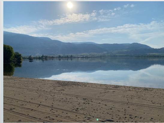
Enjoy Osoyoos Lake

Enjoy more than just the lake, like the swimming pool, golf & nearby wineries.